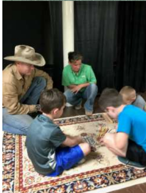
Game Night Fun