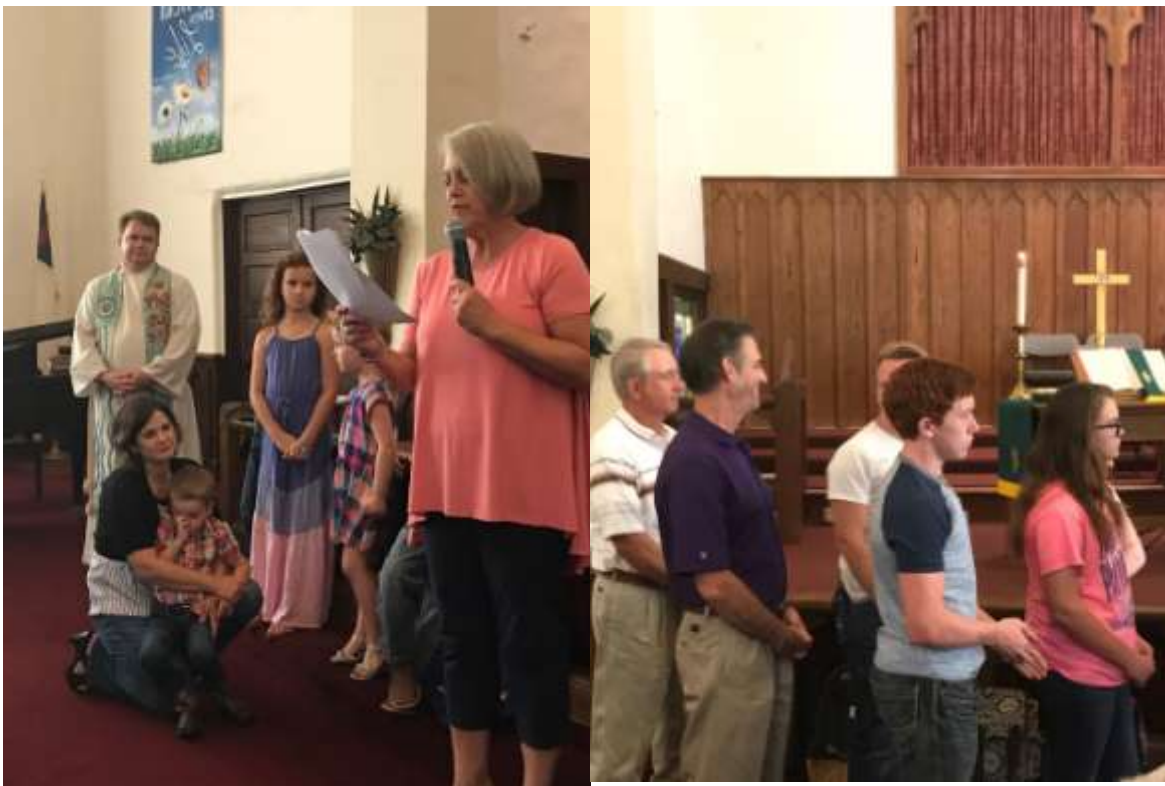
Blessing of the Back- packs