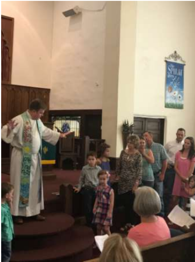
Blessings of the Backpack